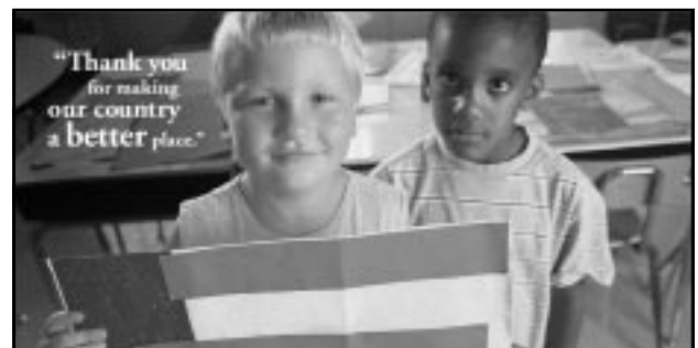
The national September 11 campaign, which featured children thanking Americans, ran locally courtesy of the Tampa Tribune, Bay News 9, Channel 8 and 970-WFLA.

The Tampa Bay Chapter was certainly affected in no small way. Our resources were stretched. The headquarters office received over 10,000 phone calls in the first week after the attacks, and over the following months, we sent 35 volunteer and paid staff members to work at the relief centers in New York and New Jersey - some up to three times. Staff members went to speaking engagements throughout our area to help people mourn and heal, and local case workers helped the families of the victims with assistance and comfort. The Tampa Bay Chapter offices processed $3 million of the $10 million the Bay area gave to the Liberty Fund (the remainder was submitted directly to the national offices). This alone kept us very busy.